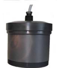
25 KHz Sensor